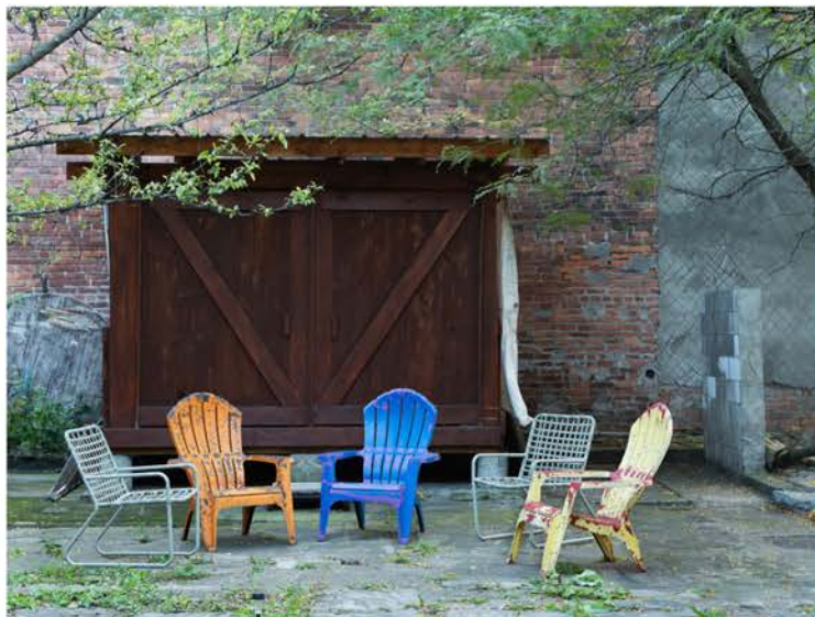
Wall side closer to elevator (east)