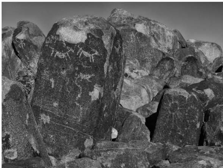
Brian J. Sesack

25. Petroglyphs – Signal Hill, Saguaro National Park, AZ // 2018 Archival inkjet pigment photographic print 16" x 20" // 6th of 35 // $350.00