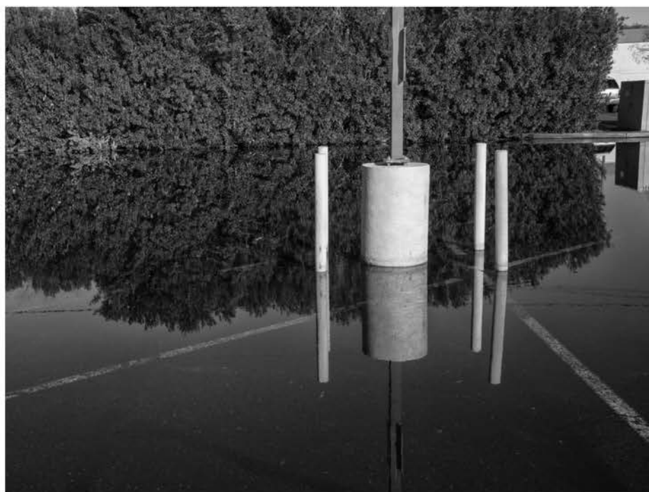
Brian J. Sesack

25. Petroglyphs – Signal Hill, Saguaro National Park, AZ // 2018 Archival inkjet pigment photographic print 16" x 20" // 6th of 35 // $350.00