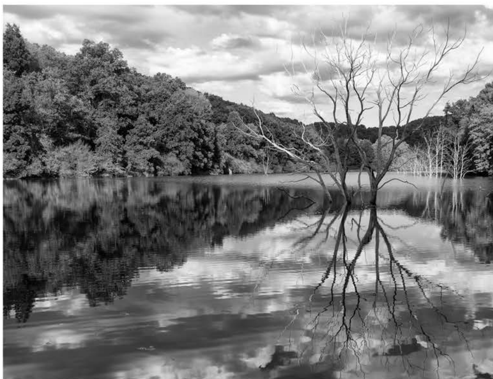
Brian J. Sesack

12. Reflections – Stonewall Jackson State Park, WV // 2022 Archival inkjet pigment photographic print 16" x 20" // 6th of 35 // $350.00