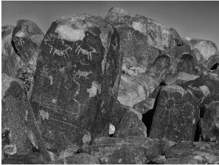
Brian J. Sesack

25. Petroglyphs – Signal Hill, Saguaro National Park, AZ // 2018 Archival inkjet pigment photographic print 16" x 20" // 6th of 35 // $350.00