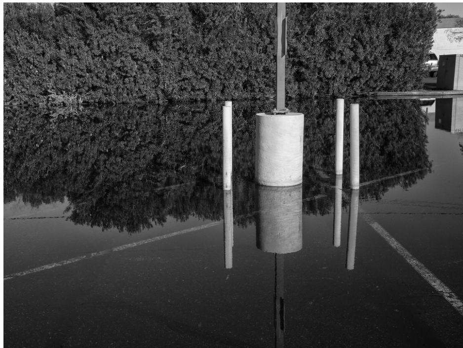
Brian J. Sesack

25. Petroglyphs – Signal Hill, Saguaro National Park, AZ // 2018 Archival inkjet pigment photographic print 16" x 20" // 6th of 35 // $350.00