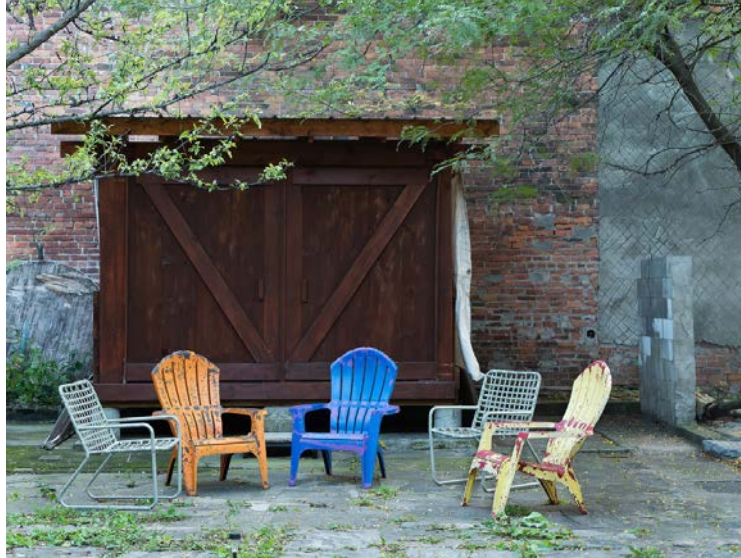
Wall side closer to elevator (east)